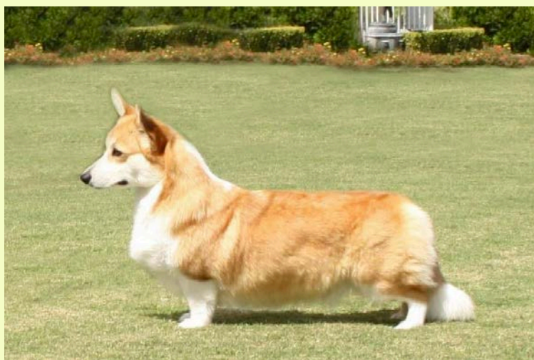
"Angel" – Ch Anwyl Angel of the Morning