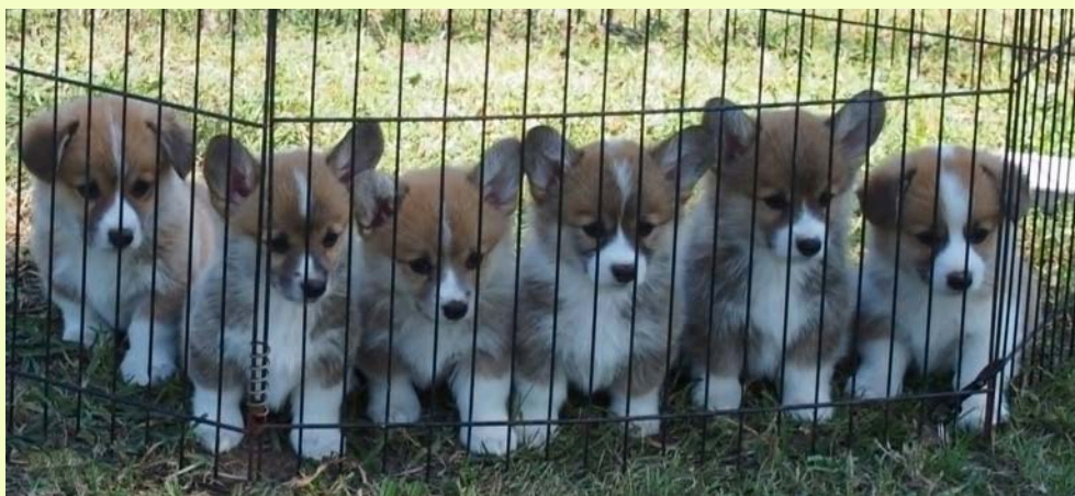
Pictured above, Angel's first litter (by Xander), three of whom went on to become Champions.