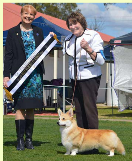
A Brock son: "Reuben" Ch Anwyl Fast Forward Solo Star (AI)