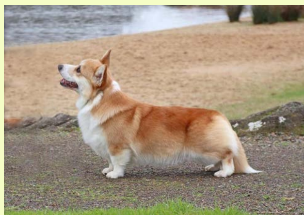
A JJ son: "Sunny" – Ch Anwyl Tell Me On A Sunday