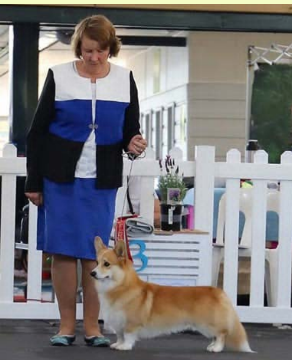
Pictured left: "Xander" Ch Anwyl Strike A Light