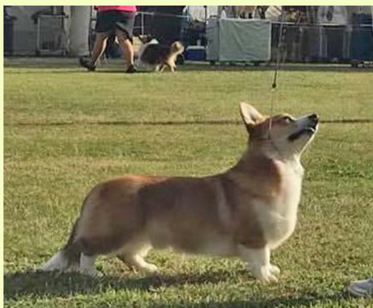
"JJ" – Ch Anwyl Leave The Last Dance For Me (AI)